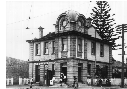
Remuera Post Office C1914.

Although many fine early Remuera houses survive, many are being lost to redevelopment. Equally, some natural volcanic features, such as Maunga Rahiri (Little Rangitoto), have been largely quarried away.