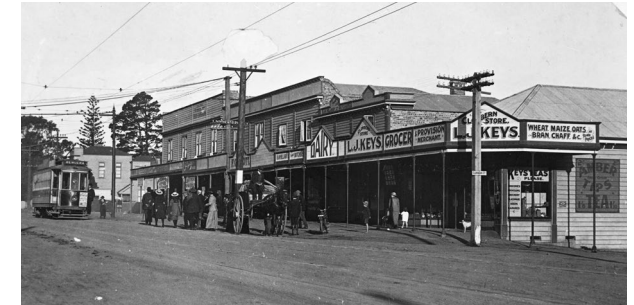
LJ Keys Grocery Store 1910.

Remuera Heritage was established in 2007. The society's purpose is to: