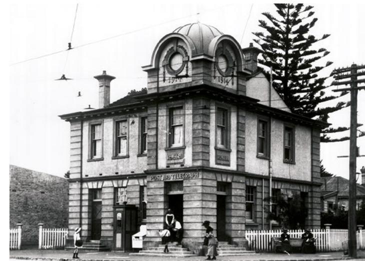
REMUERA POST OFFICE C1914.