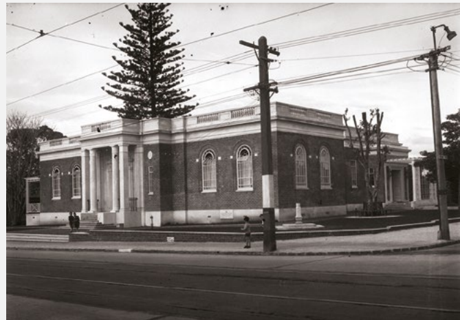
LOOKING ACROSS AT THE REMUERA PUBLIC LIBRARY C1926-9.

Although many fine early Remuera houses survive, many are being lost to redevelopment. Equally, some natural volcanic features, such as Maunga Rahiri (Little Rangitoto), have been largely quarried away.