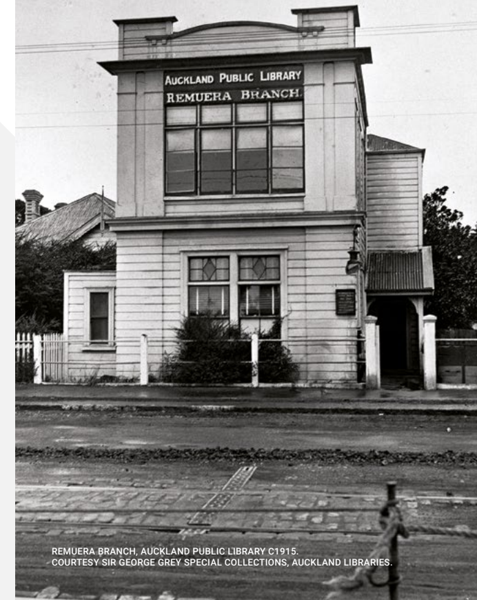
REMUERA BRANCH, AUCKLAND PUBLIC LIBRARY C1915.

STORYTELLING & CELEBRATING OUR PAST FOR THE FUTURE